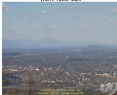
Charlottesville Newsplex Tower Cam Thursday, April 09, 2009 @ 2:16:00 PM