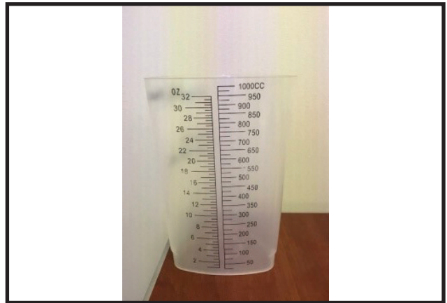
Figure 4. Ostomy Effluent Measuring Container