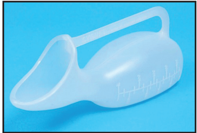
Figure 2. Female Urinal