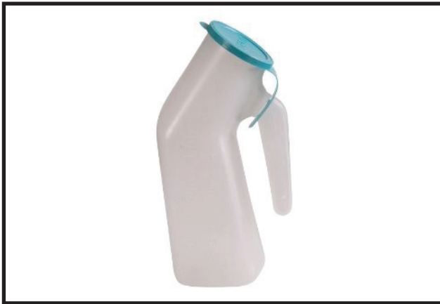
Figure 1. Male Urinal