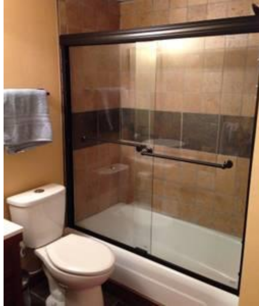
Remodeled bathroom with new: slate floor, vanity, toilet, glass tub door and slate tiles