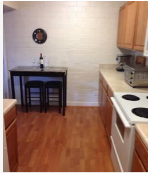
Kitchen with countertop convection oven, espresso maker, blender and woodblock cutlery set