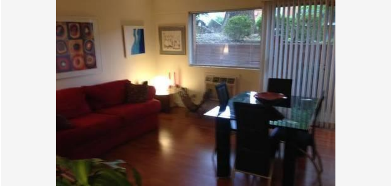
Living room has a full sofa bed, a dining table with four chairs and a flat screen smart TV attached to a pivoting wall mount