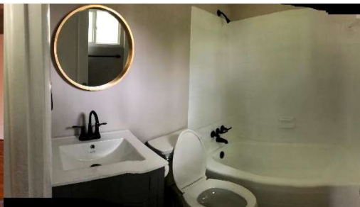
Master bedroom and bath