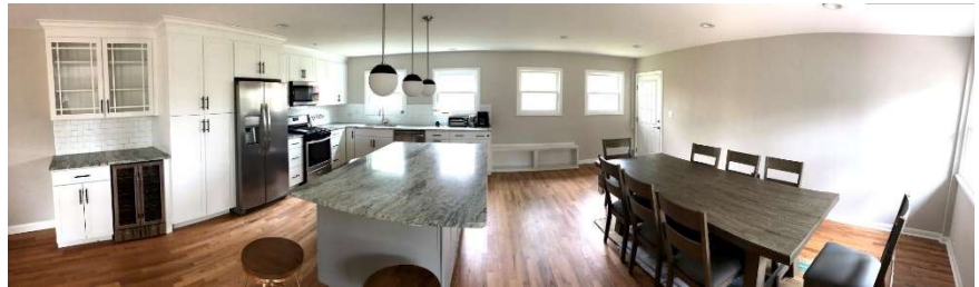
Kitchen & dining area