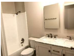
Full Bath 2