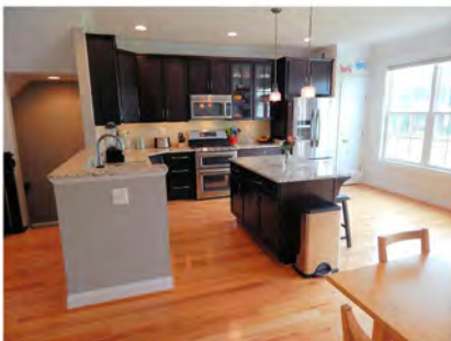
Kitchen: stove(double oven), frig, microwave, dishwasher, pantry, granite counters. Large dining area.