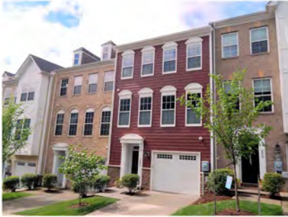
Front exterior: covered entry, 1-car garage.

2055 Avinity Loop, Charlottesville, VA 22902