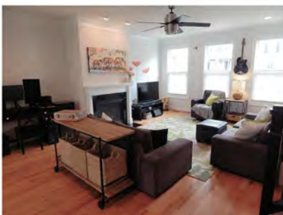
2nd level: living, dining, kitchen, 1/2 bath & patio door. Lots of windows. Gas fireplace.

3 or 4 bedroom townhouse 3 1/2 bath, 2221 sqft 1-car garage, open concept main level. Lots of windows for a bright interior.