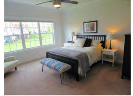
Large master bedroom, master bath with separate tub & shower, dual vanity, walk-in closet.