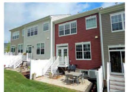
Patio access off kitchen backs up to the common lawn area. Mountain views.