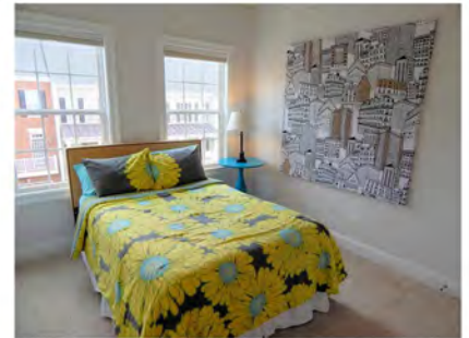
3 bedrooms on 3rd level, full bath for bedrooms #2 & #3.