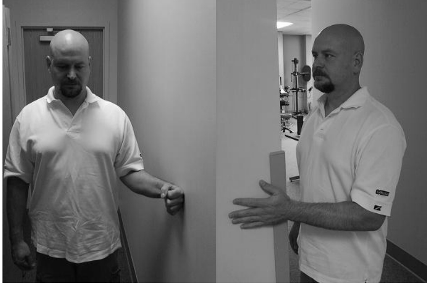
Shoulder External Rotation Shoulder Internal Rotation

AT NO TIME SHOULD YOU LIFT ANYTHING OVER 1# WITH YOUR INJURED ARM!! 415 Ray C Hunt Drive, Suite 3200 Charlottesville, VA 22903 434-982-HAND (4263)