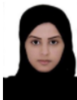
Sabah Alaklabi King Saud