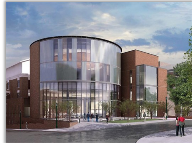
Office of Medical Education

The major meeting spaces in the Health System are listed in this brochure along with their seating capacities and contacts for requesting reservations.