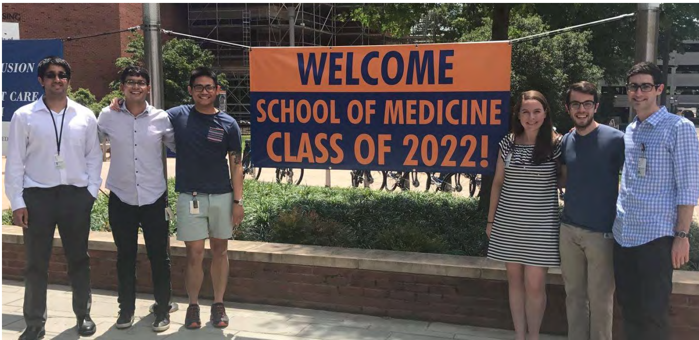
The MSTP Welcomes the Entering Class of 2018!