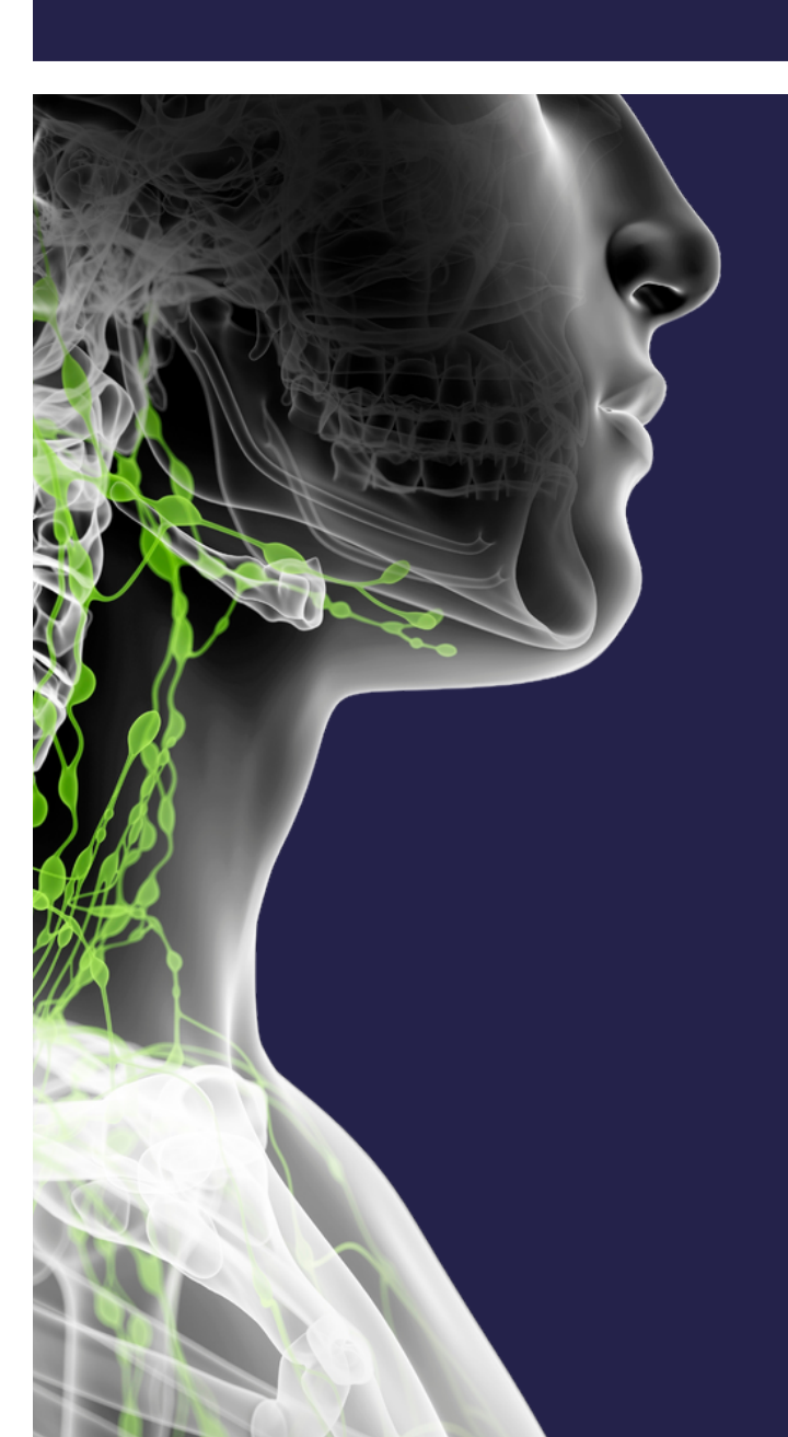
impton Charlottesville UVA DARDEN