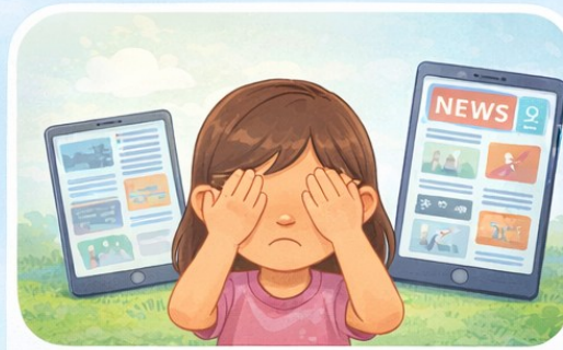
Limiting media exposure