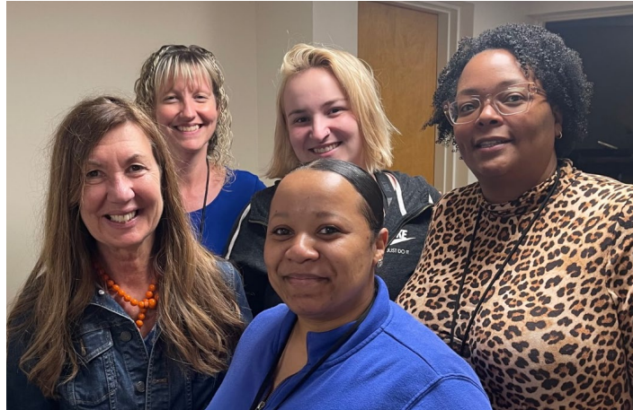
The Department Photo – April, 2023

The Plastic Surgery Administrative Team meeting up in West Complex! Thank you for all you do for our patients and our team!