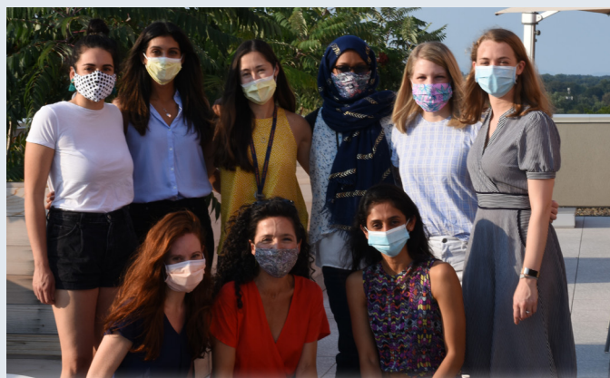
Ladyologist event, 2020

Over the past several years, we have worked as a department to increase the number of women in both interventional and diagnostic